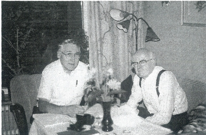
Year 2000